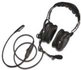
Over-the-head Heavy Duty Headset PMLN5389