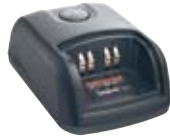
IMPRES Charger WPLN4199