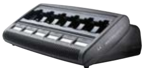
IMPRES Multi-Unit Charger WPLN4198