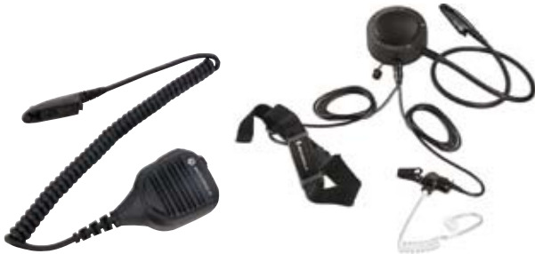
Remote Speaker Mic with Vol Control PMMN4058