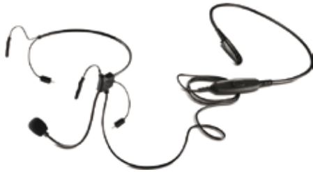
Behind-the-head Lightweight Headset PMLN5392

The benefits and assurance of the ATEX certification will be invalidated by using non-approved accessories. The Motorola ATEX accessories for the MTP850Ex have been fully tested to meet the ATEX standards. These can be used with confidence in gas and dust explosive risk areas.